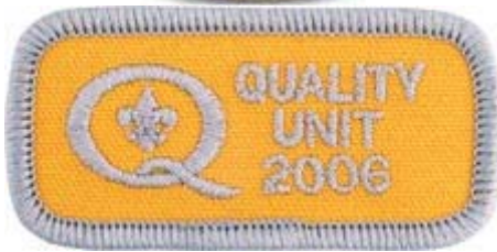
Quality Unit Patch (touching future National Honor Patrol Patch)