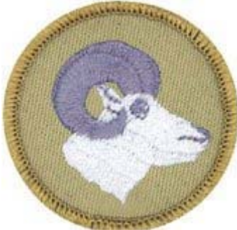
National Honor Patrol Patch (leave a 3/4" opening for this patch)