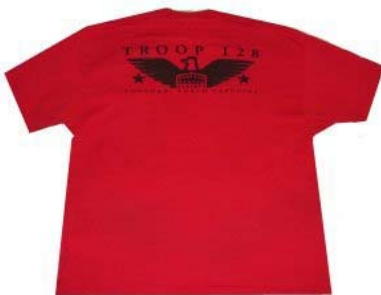
TROOP 128 T-SHIRT

Troop 128 has a Class B uniform that is to be worn during outings, or possibly at meetings when the troop decides to wear them. The Class B uniform consists of a Red Troop T-shirt, Scout Shorts (or pants), Scout Socks, Scout Belt (if not wearing "Switchback" pants that come with belt), and sturdy hiking shoes. Tennis shoes are not considered part of the Class B uniform. When joining Troop 128 you will receive 2 t-shirts, and will receive one new t-shirt each year as needed at no expense. The dues you pay cover this expense. The pants, socks, belt, and shoes are the same as worn with the Class A uniform. Always bring you Class B on outings.