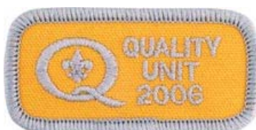
QUALITY UNIT PATCH