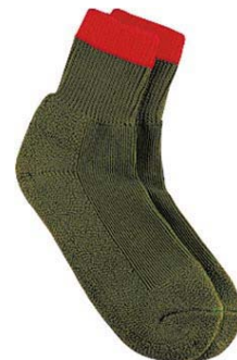
SCOUT SOCKS - $5.00 (ANKLE OR CREW LENGTH)