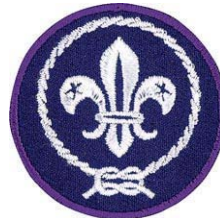
WORLD CREST PATCH $1.50