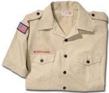
SHORT (OR LONG) SLEEVE SHIRT - $25.00