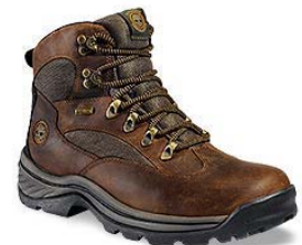
STURDY HIKING SHOES