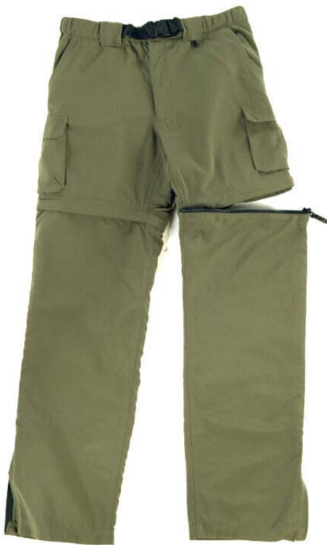
SCOUT "SWITCHBACK" PANTS (BELT INCLUDED) - $40.00