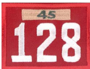
TROOP 128 NUMERALS