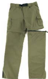
SWITCHBACK PANTS (if old style pants, wear Scout belt)