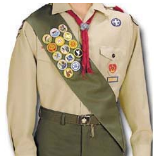
MERIT BADGE SASH - $6.00